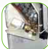
Control valve kit

Other accessories are available for custom assemblies