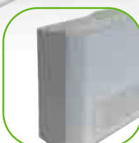
Assembly 1D, front grille