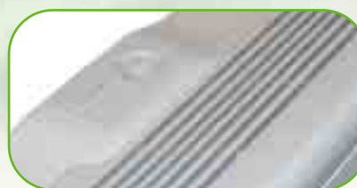
Flush-mount V30 thermostat