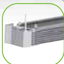
Fresh air/return air mixing box